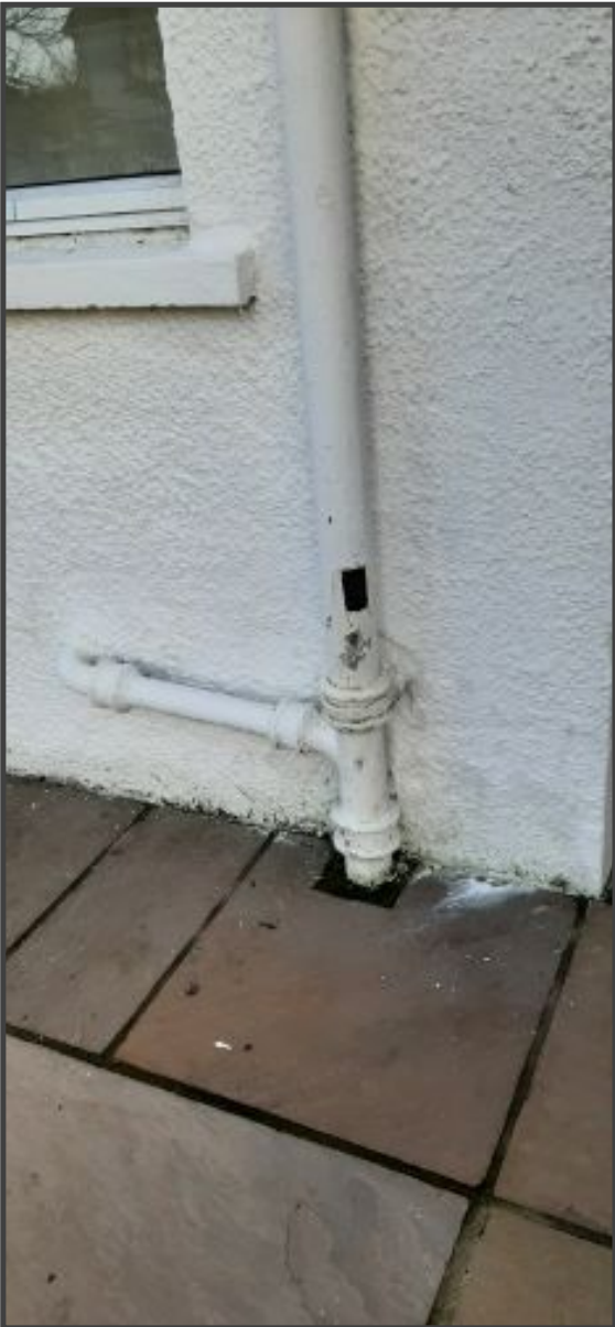
OPEN INSPECTION POINT IN DOWNPIPE